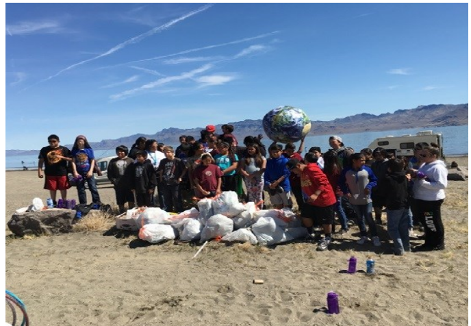
Youth Clean Up