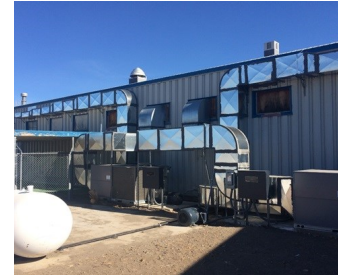
Nixon Gym HVAC Project

The system provided much improved climate control in the gymnasium; the old system was in failing condition as the gymnasium was cold in the winter and hot in the summer. The Tribal staff working in the gymnasium and the community members who use the gymnasium notice the