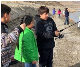
Fishing Day at Pyramid Lake

◆ Collaborated with the Health Department which provided Yoga