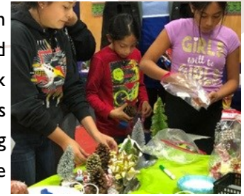
Family Craft Night