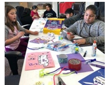
Family Craft Night