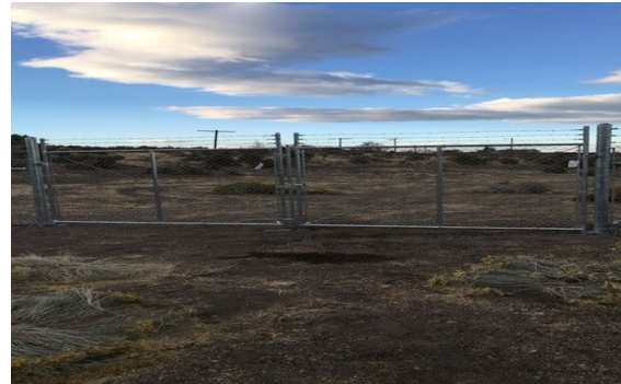
New fence