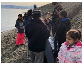
Fishing Day at Pyramid Lake