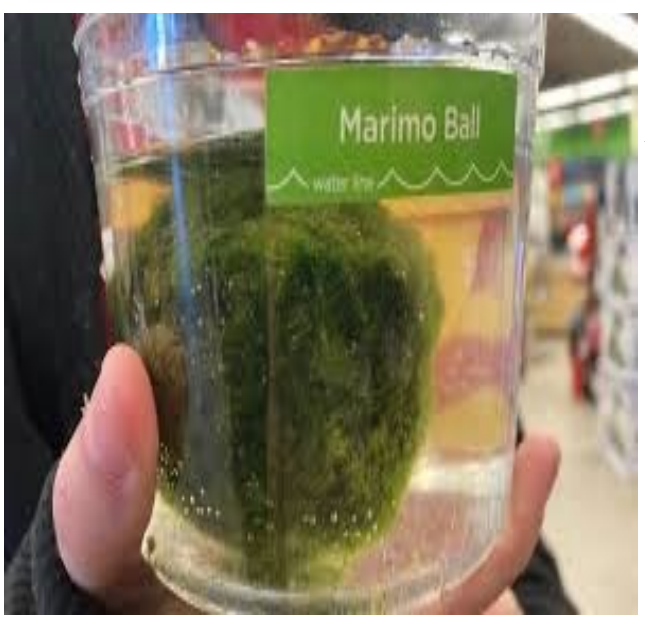
A Betta Buddy Marimo Ball, which were being sold at Petco, and are currently being pulled from shelves.

Moss Balls are used in aquariums to remove nitrates, etc., and are commonly sold at pet stores. People commonly will dump their aquarium or fish bowls, bait fish into waterbodies, not realizing they could be introducing invasive species, which could become very costly to eradicate.