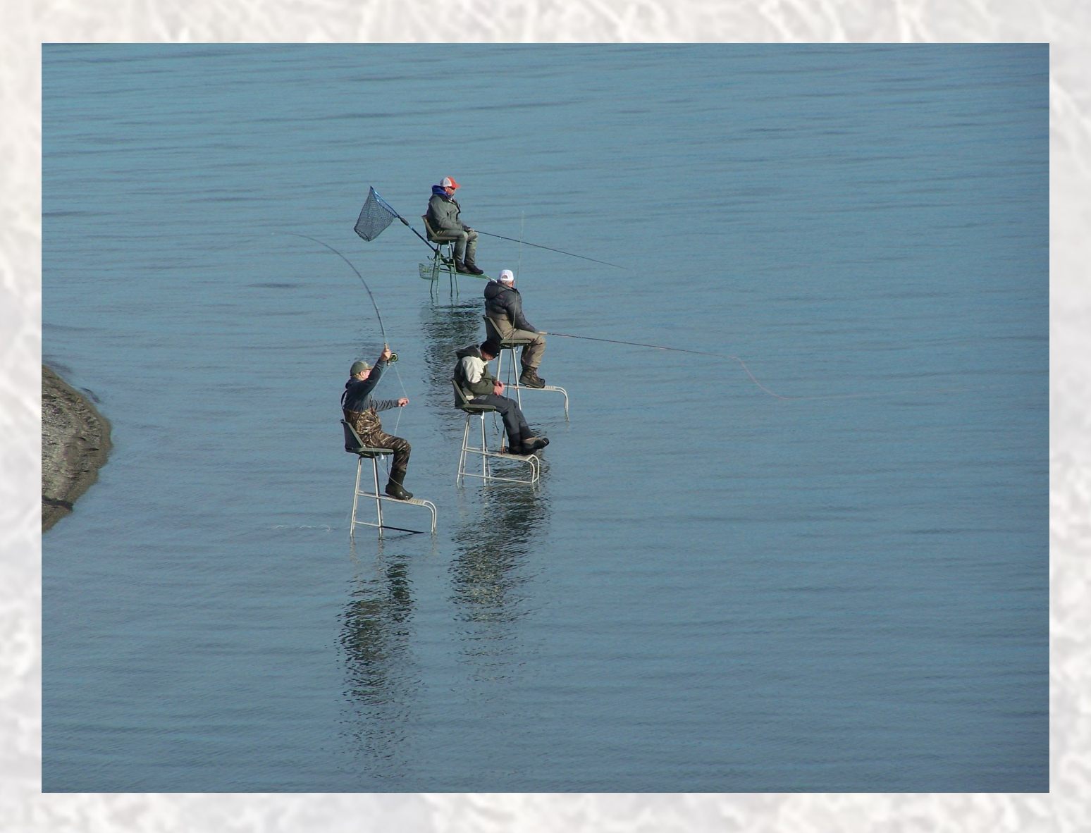
Ladder Chair fishermen

Pyramid Lake Fishermen today are known for fishing on ladders, or from a custom built 'ladder chair' on a frame welded from galvanized metal. This practice started many years ago, using milk crates to allow fishermen to fish further out into the deeper waters of the lake. Back in the day, fishermen began standing on objects like used milk crates, in their attempt to get higher out of the water, above the waves, and to stay a little bit warmer. Duck decoys were often used as floatation devices to mark the location of the milk crates.