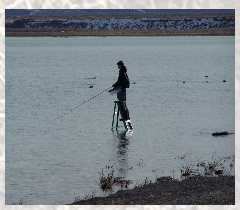
Ladder fishermen