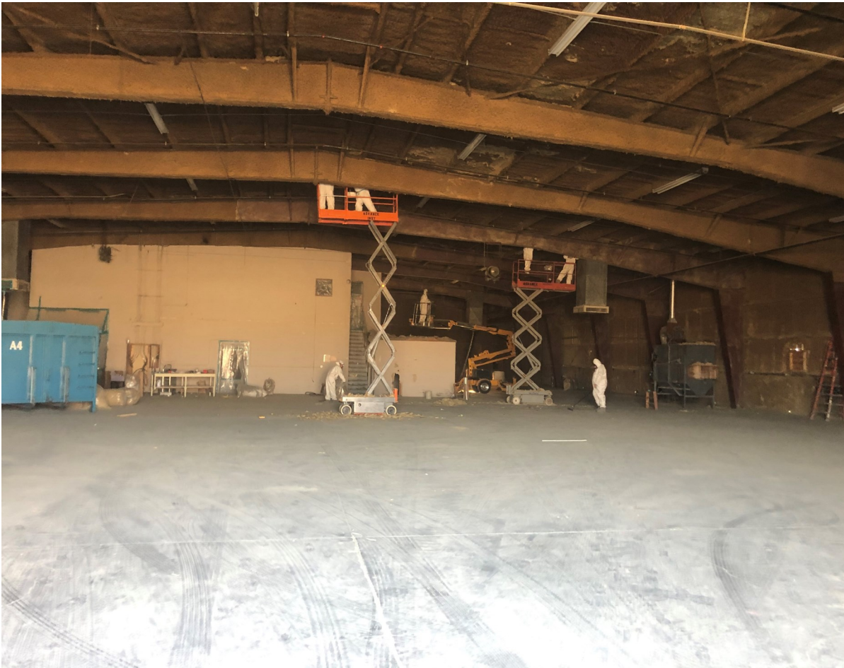
Early work of converting the NEVCO building in Wadsworth to a food bank

From the Pyramid Lake Housing Authority, their team was able to work on converting the NEVCO building in Wadsworth to a working food bank for the community. Two daycare buildings were added to the current facilities in Nixon and Wadsworth. The renovation of Sutcliffe Learning Center included new windows, kitchen, new building paint, new floors, fan and ceiling work. Much of this work will be completed by March 2021.