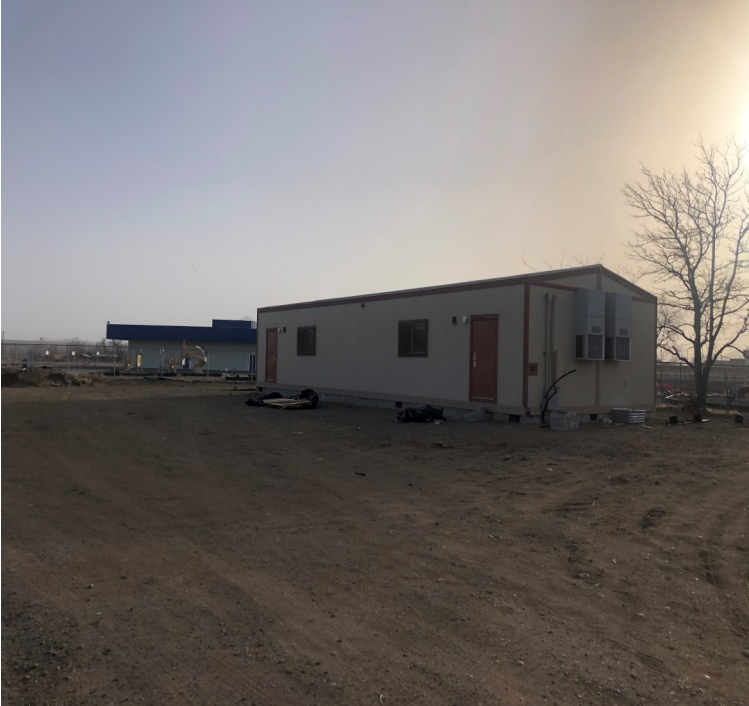
Located just behind the Renegade Radio Station, the new addition to the Wadsworth Daycare building will include installation of ramps and steps.