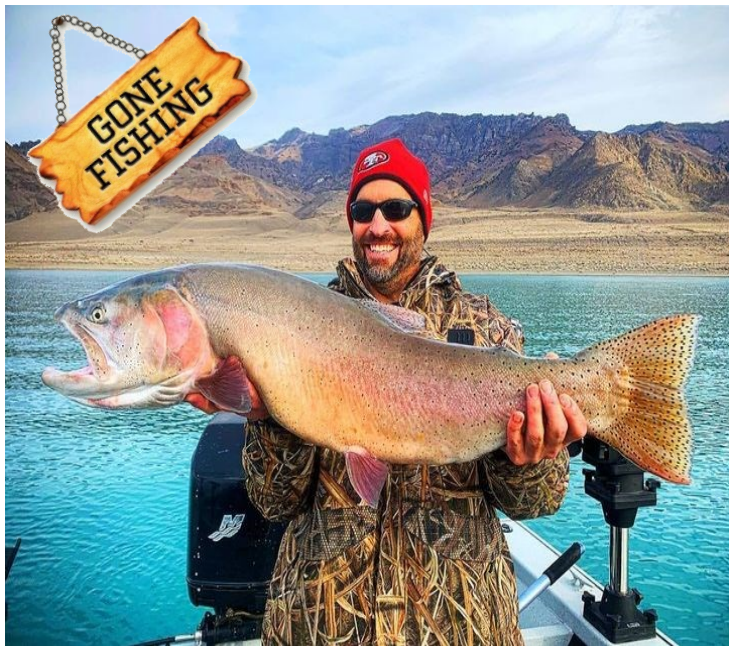
January 16, 2021—Nevada Fish Reports